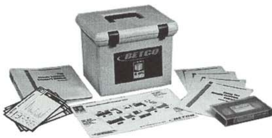
Complete Training Programs.