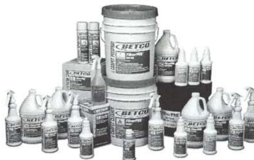
Complete Carpet Care Program.