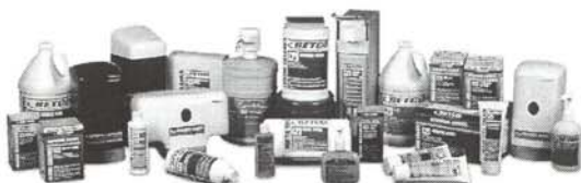
Complete Hand Cleaner Line.