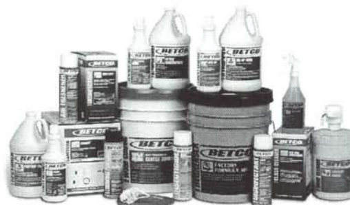
Complete chemical programs, cleaners, floor care and specialties.