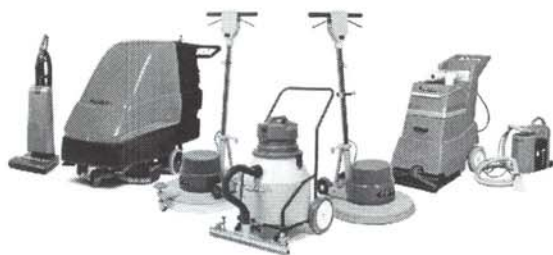
Complete Floor Machine, Vacuum and Scrubber Line.

Betco is now the only manufacturer with a complete line for BSC's.