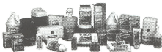
Complete Hand Cleaner Line.