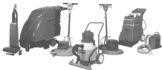
Complete Floor Machine, Vacuum and Scrubber Line.

Betco is now the only manufacturer with a complete line of products for the cleaning professional.