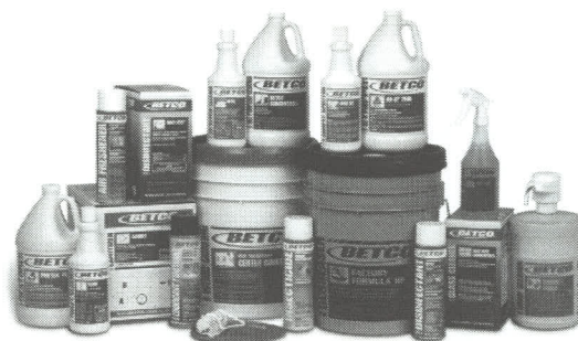
Complete Chemical Programs, Cleaners, Floor Care and specialties.