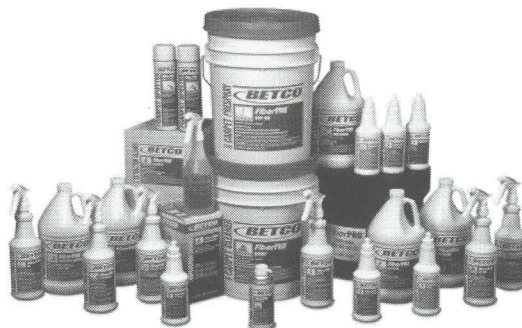
Complete Carpet Care Program.